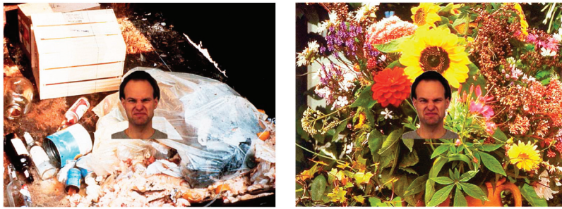
Figure 1. Example of a face–context stimulus. Facial expressions of fear, happiness, and disgust were paired with contexts of fear, happiness, and disgust. These pairs could constitute congruent emotions (left)—for instance, a facial expression of disgust in a context of garbage—or incongruent emotions (right)—the same expression, shown among flowers.

2006). In contrast with our previous study that had used only fearful facial expressions, in the present study, we used facial expressions of disgust, fear, and happiness that could form clear congruent and incongruent combinations with the accompanying emotional scenes.