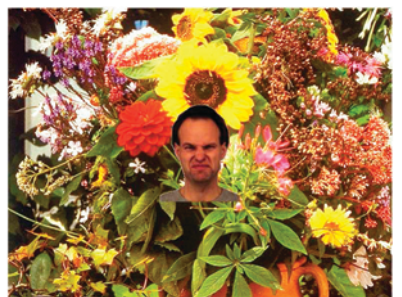
Figure 1. Example of a face—context stimulus. Facial expressions of fear, happiness, and disgust were paired with contexts of fear, happiness, and disgust. These pairs could constitute congruent emotions (left)—for instance, a facial expression of disgust in a context of garbage—or incongruent emotions (right)—the same expression, shown among flowers.

2006). In contrast with our previous study that had used only fearful facial expressions, in the present study, we used facial expressions of disgust, fear, and happiness that could form clear congruent and incongruent combinations with the accompanying emotional scenes.