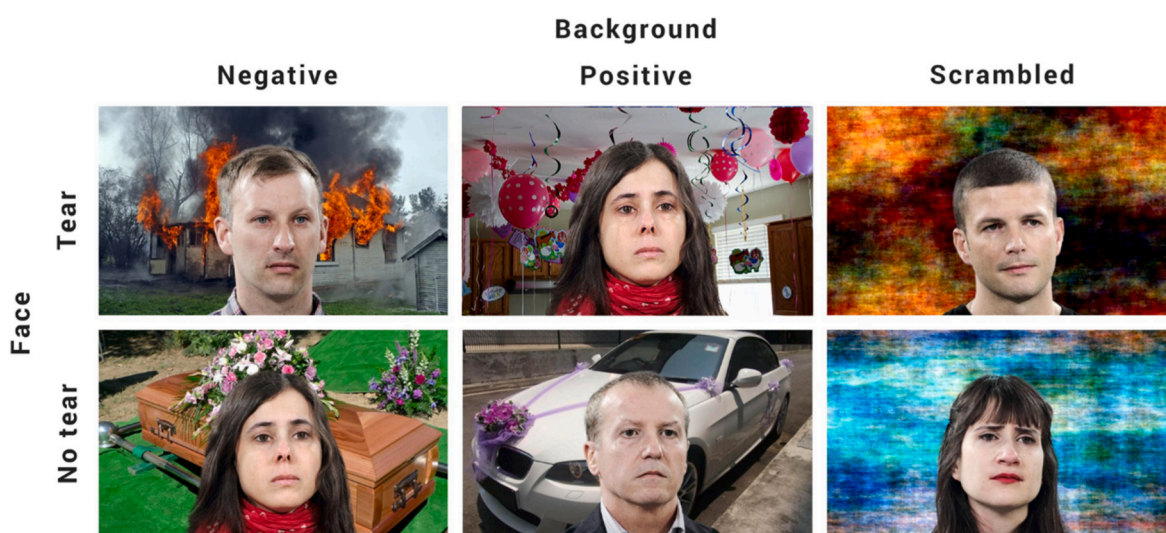
Fig. 1. Examples of stimuli. Compound stimuli consisted of faces with tears or with digitally removed tears and of backgrounds that were either negative, positive, or scrambled. The stimuli included both male and female faces.

The data of three participants consisted of only three functional runs due to technical problems, the rest of the participants completed four runs each.