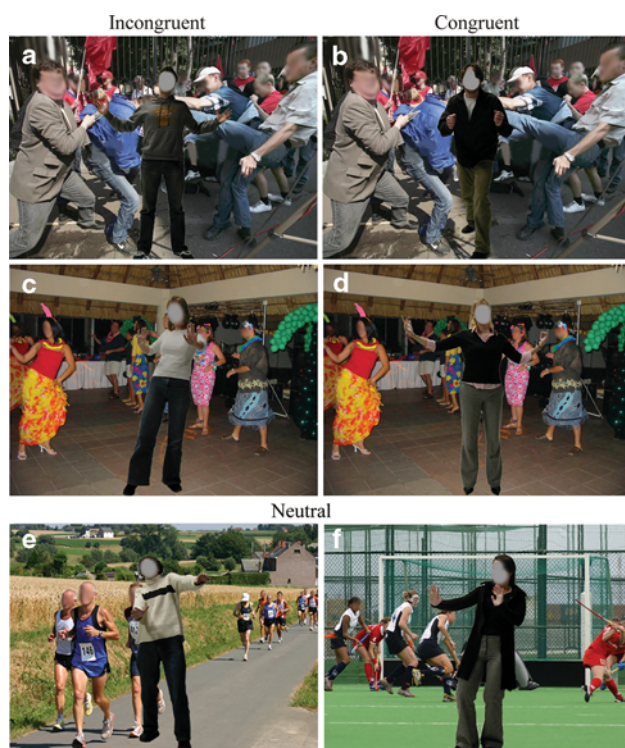
Fig. 1 a The upper left figure shows a man who is joyfully surprised and greets an old friend. Strangely, this man is in the middle of a fight. b The upper right figure shows a man who is threatening another person that also wants to join the fight. c Middle left : the woman on the foreground is frightened at something but the other people in the scene do not experience the situation as threatening and are still enjoying the party, as can be read from their body language. The incongruence makes recognition of the emotion of the foreground figure difficult. d Middle right : the girl on the foreground is happily welcoming a new visitor/a friend at the party. Her emotion matches the social situation and the emotion of the other people. e/f The figure below shows a man ( left ) and women ( right ) who are frightened at something. The people in the scene are involved in sports. Body expressions are easier to recognize when congruent with the social scene

participants (in version 1, fear was button nr.1 on the response box and happy button nr. 2 and in version 2 the inverse), we were able to select different scrambles per version and use as many different ones as possible. Initially, we meant to use the scrambled condition as a non-emotion, non-action condition. However, across all experiments, bodies were significantly better recognized in these scrambled contexts than in unscrambled contexts (possible pop-out effect or due to the semantic information content of the background) ( t(175) \leq 2.58 , P \leq .01 ) similar to the results for faces in scrambled context observed in Righart and de Gelder (2006). Therefore, the neutral condition was considered as a more viable baseline (see also Sommer et al. 2008). Compared to the scrambled scenes, neutral scenes still contain action (without emotion) and were therefore considered a better baseline.