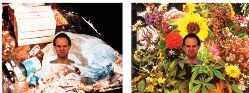
Figure 1. Example of a face–context stimulus. Facial expressions of fear, happiness, and disgust were paired with contexts of fear, happiness, and disgust. These pairs could constitute congruent emotions (left)—for instance, a facial expression of disgust in a context of garbage—or incongruent emotions (right)—the same expression, shown among flowers.

2006). In contrast with our previous study that had used only fearful facial expressions, in the present study, we used facial expressions of disgust, fear, and happiness that could form clear congruent and incongruent combinations with the accompanying emotional scenes.