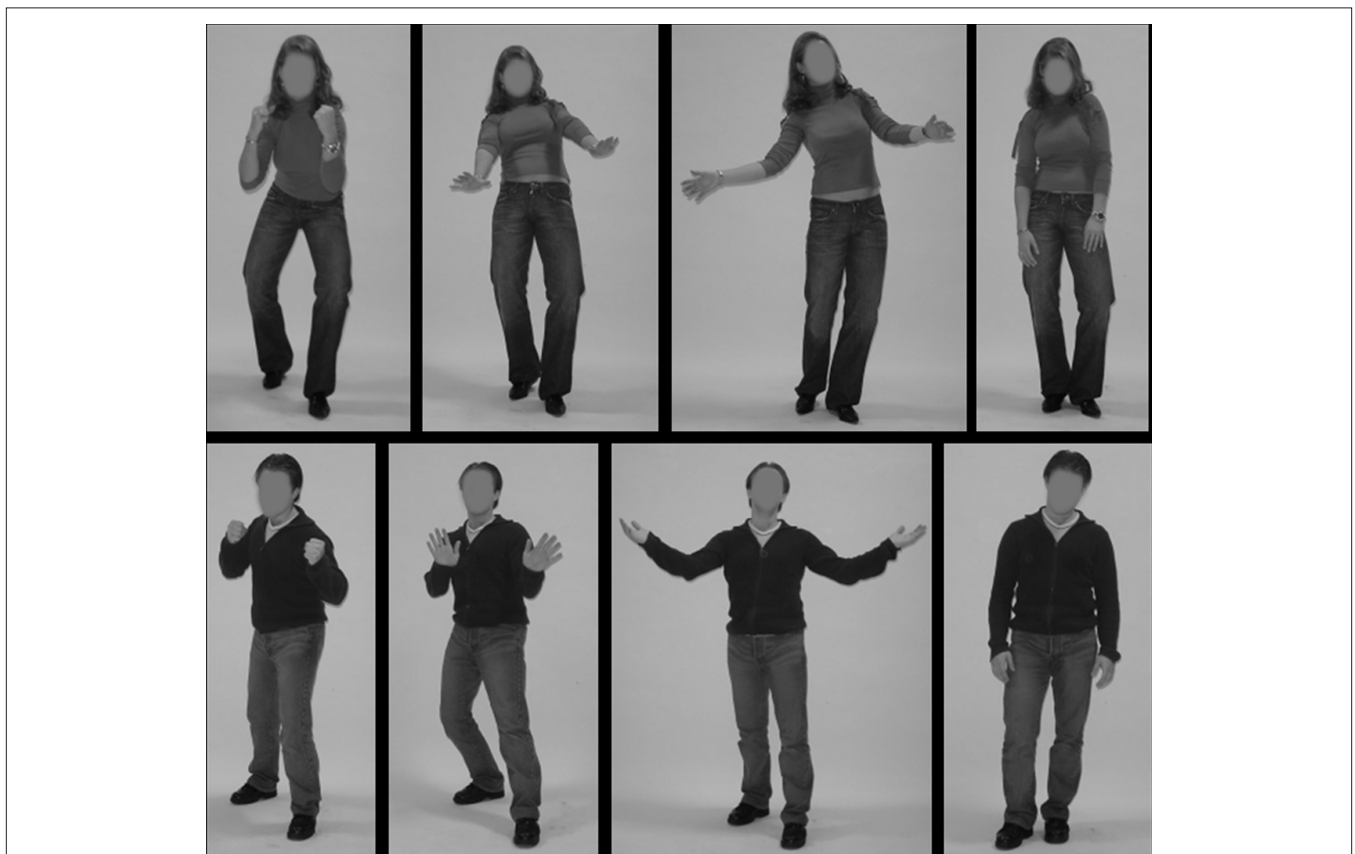
FIGURE 1 | Examples of edited stimuli showing a female (top row) and male (bottom row) actor. The expressions display (from left to right): anger, fear, happiness, sadness.

Nineteen participants [11 female, mean (std) age: 22.5 (2.4)] took part in the validation experiment in exchange for course credits. All 254 stimuli were randomly presented one by one for 4000 ms with a 4000-ms inter-stimulus interval during which a blank screen was presented. The participants were instructed to categorize the emotion expressed in the whole body stimulus on an answering sheet in a four alternative-forced-choice task (anger, fear, happiness, sadness).